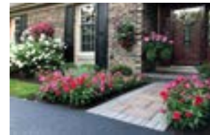
DOORS OF PALATINE