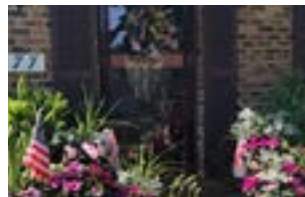
DOORS OF PALATINE