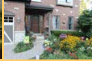
DOORS OF PALATINE