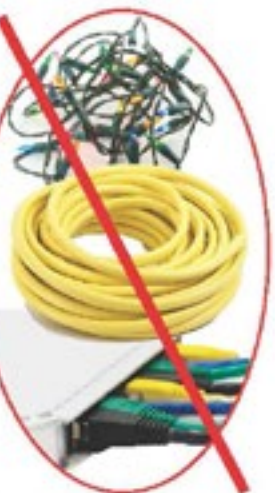
No Hoses, Wires, or Hangers