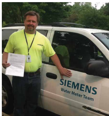
Water meter installers start work in the field

Details of the water meter project can be found on the Village website at www.palatine.il.us/watermeters . You can also contact Siemens at (855) 620-7993.