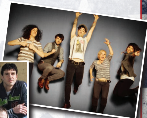
Dot Dot Dot