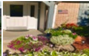
DOORS OF PALATINE