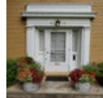
DOORS OF PALATINE