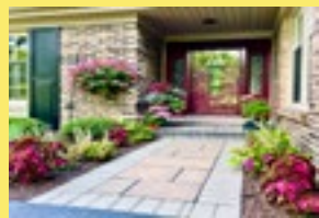
DOORS OF PALATINE