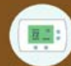
Central Air Conditioners

Basement items are covered under Building Coverage if they are connected to power and installed. Examples include: