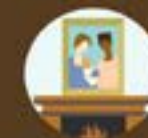
Family Photographs or Keepsakes