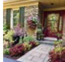
DOORS OF PALATINE