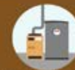
Furnaces and Hot Water Heaters