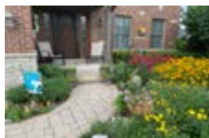
DOORS OF PALATINE