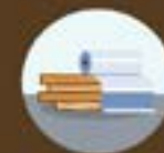
Finished Basement Home Improvements

Items not specifically listed in the policy are not covered in a basement. Examples include: