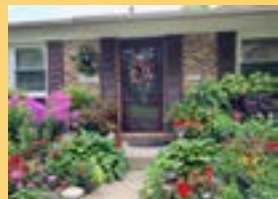
DOORS OF PALATINE