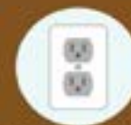
Electrical Outlets and Light Switches