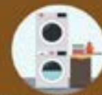
Clothing Washers and Dryers

Basement items are covered under Contents Coverage if they are connected to a power source. Examples include: