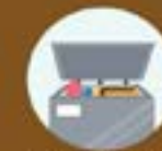
Freezers and Contents