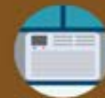
Window Air Conditioners