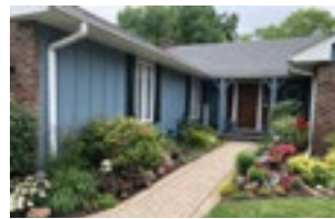
DOORS OF PALATINE