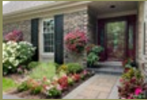
DOORS OF PALATINE