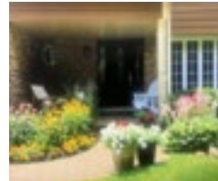
DOORS OF PALATINE